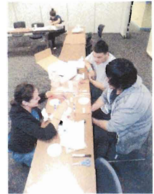
7.18.13 Behind the scenes look at careers at the Texas State Aquarium with 6 students. We attended crime scene training at the Art Museum.