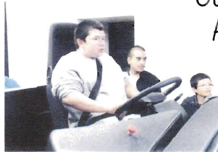
11.16.12 We took 6 students out to Ainsworth Trucking to look at careers in the trucking industry. Our students even got to try out the trucking simulator there, which Ainsworth uses to test truckers' skills.