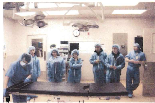
2.26.13 HELP took 20 students on a tour of Spohn Shoreline Hospital, Humpal Physical Therapy, and Gold's Gym.