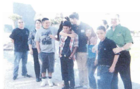
8.15.13 Our next mentor/mentee activity was taking 7 students and mentors to see Les Miserables at the Harbor Playhouse.

4833 Saratoga #447 Corpus Christi, TX 78413 www.helphelp.us