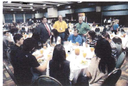
5.1.13 HELP took 10 students to the Texas Oil and Gas Conference, where they got to look at different oil and gas-related jobs and meet US Rep. Blake Farenthold.

4833 Saratoga #447 Corpus Christi, TX 78413 www.helphelp.us