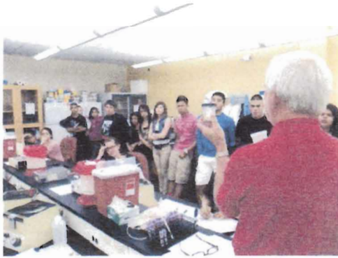
6.12.13 We took 10 students check out the lab at Del Mar West, where they also looked at careers in automotive, cosmetology, dental, and radiography.