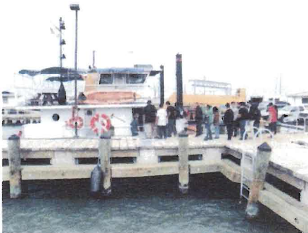
3.28.13 We took 17 students on a tour of the Port Area, including the US Coast Guard cutters.