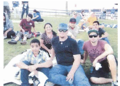
8.1.13 We kicked off the new individual mentoring aspect of our program with an icebreaker baseball game, attended by 15 students, 12 mentors, Judge Chesney, and probation officers as well. It was a great success!