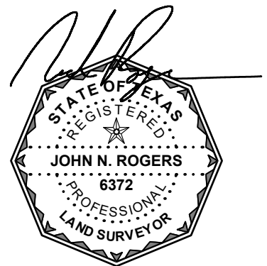
Exhibit map attached and made a part hereof.

Bearings are referenced to Texas State Plane Coordinate System, North Central Zone (4202), North American Datum of 1983 as derived from GPS observation.